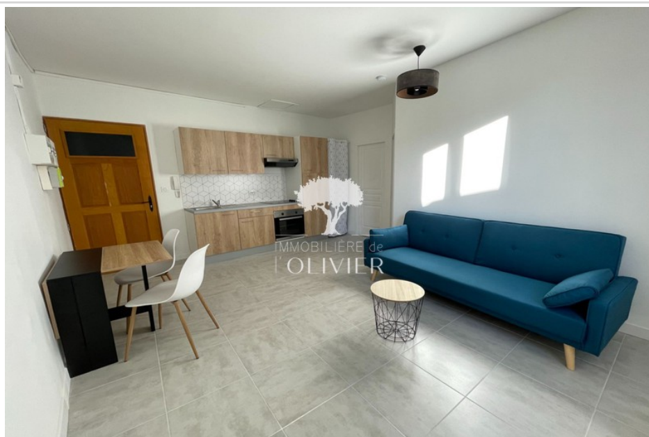
Apartment 2021-65 Apt

Luberon - Apt - Downtown, fully new furnished bright T2 in a renovated building. The accommodation has a fitted and equipped kitchen (fridge, hob, extractor), water supply for the washing machine, a lounge area and a bedroom. Lots of storage, electric heating with dry inertia, free parking nearby Need a guarantor? Think of the VISALE.FR guarantee or the GARANTME.FR guarantee