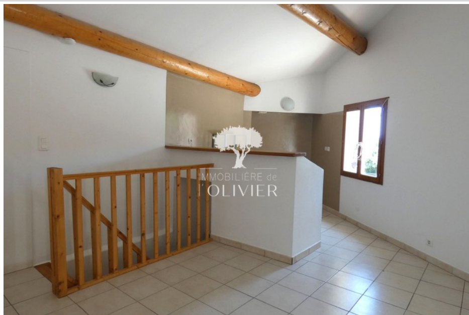
Apartment 2020-19 Saint-Saturnin-lès-Apt

Emission of greenhouse gases (ges) : Virgin to eps