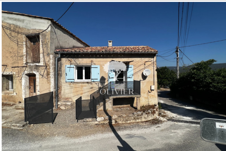
Maison de village / ville 2319 Saint-Saturnin-lès-Apt

luberon, t2 small house in hamlet comprising a living room with kitchen, a bathroom with toilet and bedroom. location for green space vehicle available. Heating electric, empty rental period 36 (months) ecd class: f